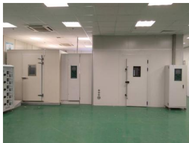
9 cubic meters low temperature room, 13 cubic meters high temperature room