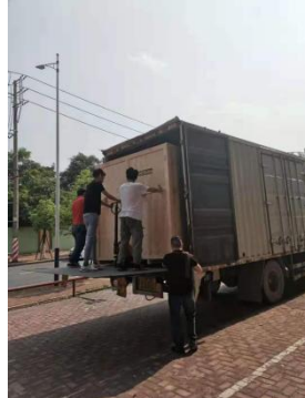
Save you 30%