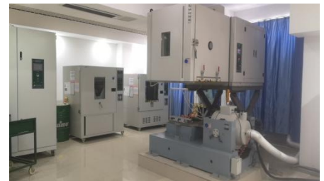
Three comprehensive and humidity test chamber