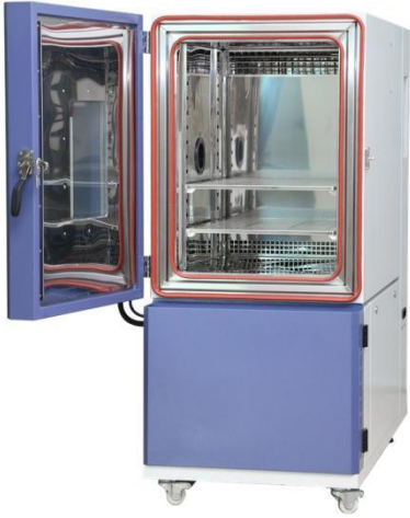
150L Vertical high and low temperature test chamber