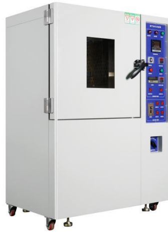
Ventilation type aging test chamber