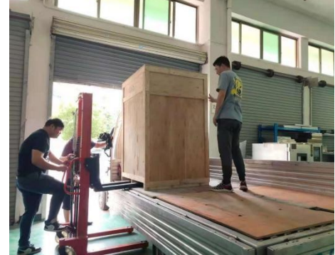
Quality and after-sales are recognized by customers