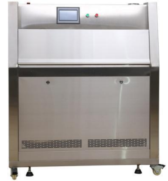
Leaning tower ultraviolet aging test chamber