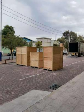
Self-produced and sold