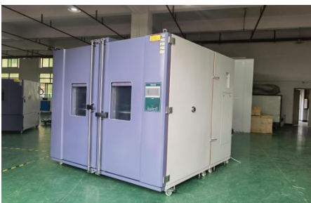
3.6 m3 constant temperature laboratory