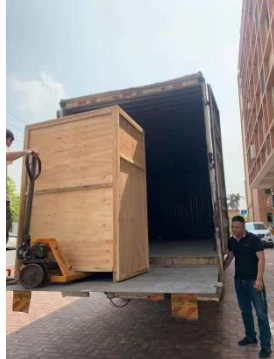
No dealer link