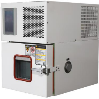
225L High and Low Temperature Humidity and Heat Alternating Test Chamber